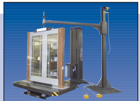
TOP PLATEN Option (HP Shown) Stabilizes Load During Rotation