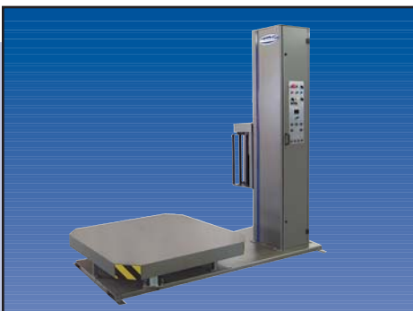
SIDEWINDER® 6 High Profile (HP)