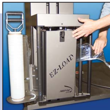
EZ-LOAD FLM SAVR® Powered Pre-Stretch with Standard EZ-QUICK-LOAD® Film Mandrel