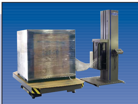
SIDEWINDER® 6 WRAP-N-WEIGH® with Extended FLM SAVR and 50x90 Turntable Option